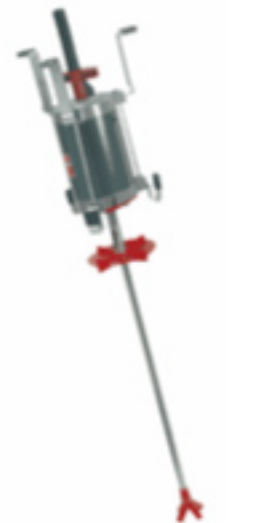
Jet Inc Aerator

The aerator is an essential part of the home septic system and requires routine maintenance. A qualified service technician can demonstrate the maintenance procedure to you. It is a simple procedure and should be performed as needed. If you experience aerator alarms or debris on the shaft, first take preventive measures to eliminate the source of the debris or clogging of the shaft, then set up a regular maintenance schedule to make sure the aerator is operating properly.