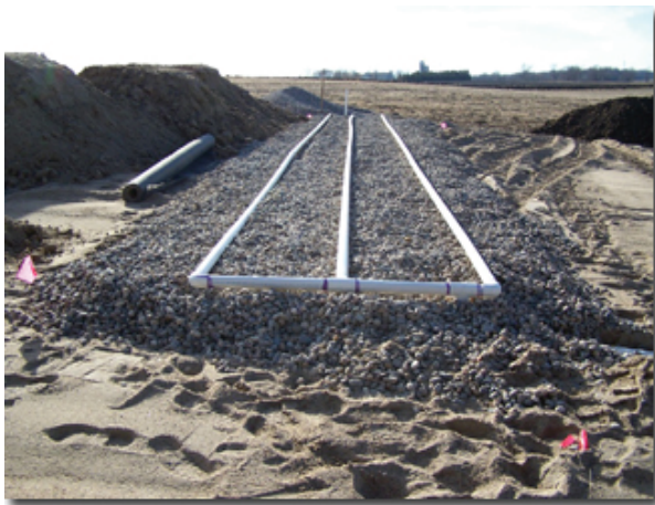
Mound septic system in process

The technician has performed the maintenance on your system. He has noted on the maintenance report that the mound is draining slow. What does this mean??