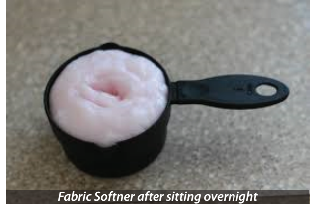
Fabric Softner after sitting overnight

Fabric Softeners coat our clothes with a subtle layer of slimy chemicals, which make them feel softer. The most common chemicals, called "quats" (quatamary ammonium compounds) contain antibacterial qualities, petroleum and emulsion stabilizers. These can be harmful to the bacteria living in your septic system and their slimy quality can adhere to the aerator, filter or stick in the mound or leach field causing problems.